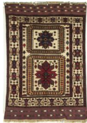
6 A Persian Kelim carpet, Iran 5'10" x 12' $400-600