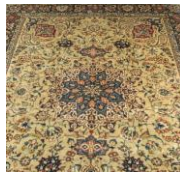
51 A Kerman carpet, Central Persia, 10' x 21'3" $3,000-3,500