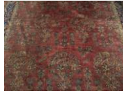
57 A Persian carpet 11'10" x 14'6" $1,500-2,500