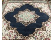
53 A Persian Kerman Lavar carpet, Iran 9'11" x 14'4" $675-700