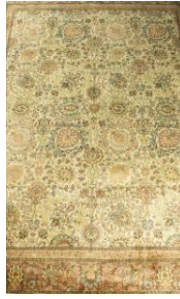
43 A Grn carpet, Pakistan, 9'1" x 12'5" $750-1,000