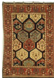
10 A Tibetan carpet, Nepal 8' x 10'3" $750-800