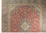
45 A Lavar carpet, North Persia, 9'6" x 18'3" $2,500-3,000