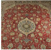
63 A French carpet, China, 11'8" x 18'4" $1,500-2,000