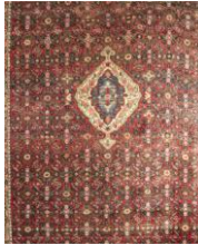
67 An antique oval carpet, China, 8'4" x 12'6" $1,100-1,300