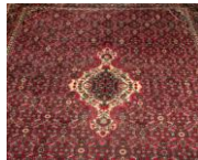
49 A Persian carpet, Iran, 9'6" x 13'6" $750-950