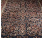
47 A Tabriz carpet, Northwest Persia, 9'9" x 13'3" $1,500-1,700