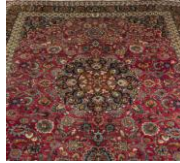
55 A Persian Pakistan, Pakistan, 9'10" x 20'9" $2,400-2,600