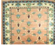
65 An antique Bijar carpet, Persia Kurdistan, 6'10" x 20'3" $3,600-4,000