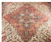
61 A Kerman carpet, Central Persia, 9'10" x 13'4" $700-900