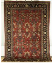
12 A Kerman carpet, Central Persia, 10'1" x 12'9" $700-900