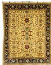
8 An Indo Persian carpet, India, 7'11" x 10'1" $1,500-1,700