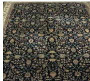
59 A Atiyeh, China 12' x 15' $3,500-4,000