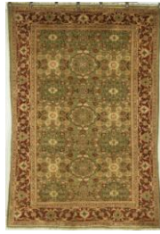
2 An antique Caucasian carpet, Russia, 6'4" x 12'10" $2,500-2,700