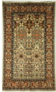
4 A Malayer carpet, Northwest Persia, 6'9" x 16'5" $1,700-2,000